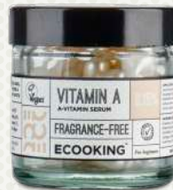
Vitamin A 0,15% 60 capsules Total 20 ml - 0.7 fl. oz.

APPLICATION: Use at night after cleansing and before cream. Twist the top of the capsule and apply the content. The capsule is made of biodegradable material and can be dissolved in water after use.