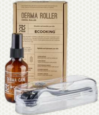
540 needles, 0.5 mm

GOOD TO KNOW: Your Derma Roller comes with an empty bottle. In it, you mix your own Derma Care consisting of water and rubbing alcohol in a 1:1 ratio. Clean your Derma Roller with Derma Care after use and never just before use, as you will then be rolling the mixture into the skin.