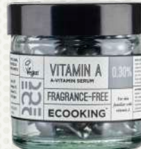
Vitamin A 0,30% 60 capsules Total 20 ml - 0.7 fl. oz.

TINA'S TIP: You can also give your skin a moisturising treatment by using Vitamin A Serum 60 days both morning and night.